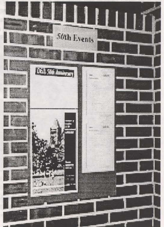
Part of the 50th display in the lobby of FLB, containing the graphic by Mark Cowan.